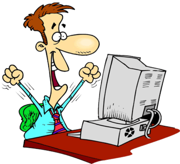
Approach # 1